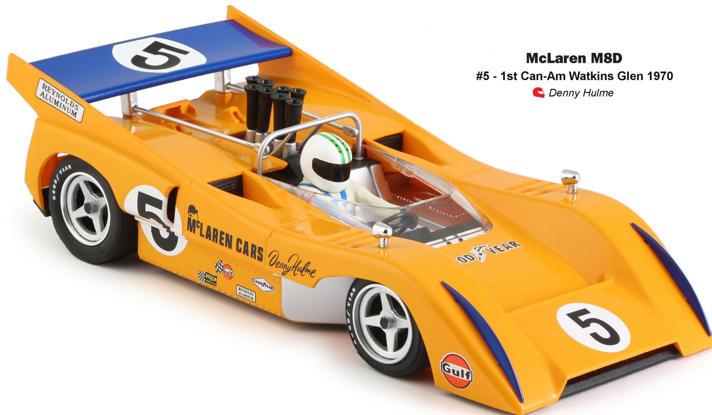
McLaren M8D #5 - 1st Can-Am Watkins Glen 1970 🇨🇦 Denny Hulme