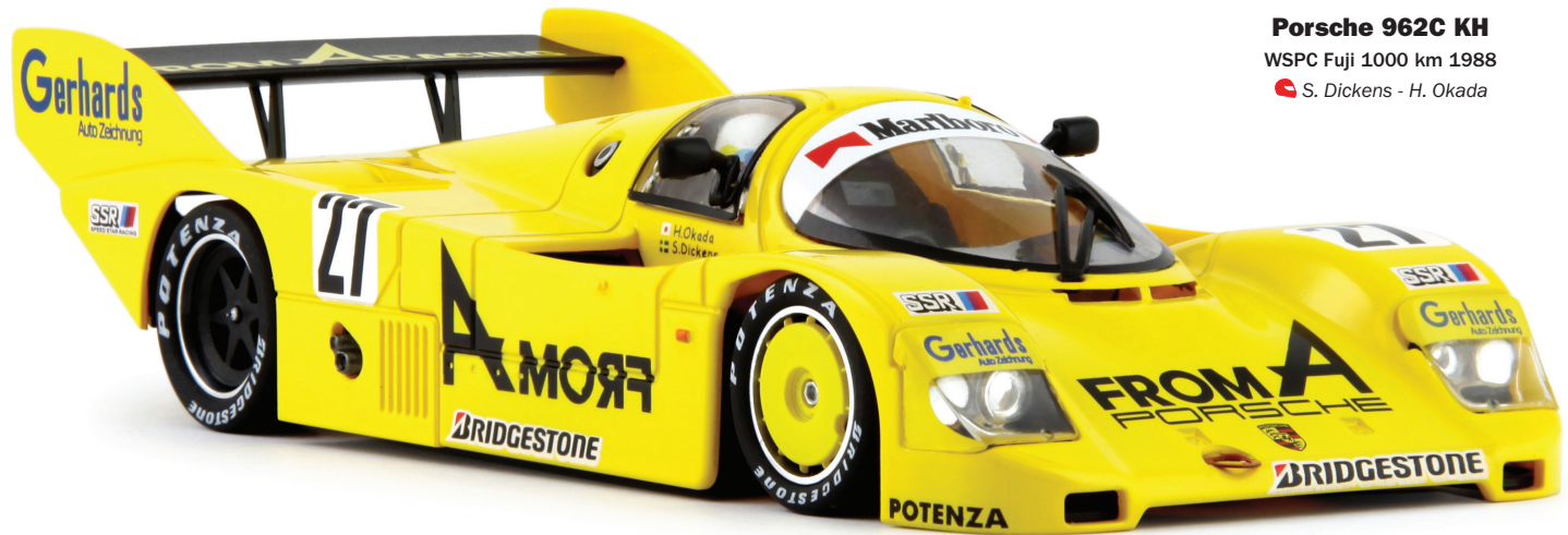
Porsche 962C KH WSPC Fuji 1000 km 1988 S. Dickens - H. Okada

Offset 0.5 motor mount 16,5 mm rear wheels